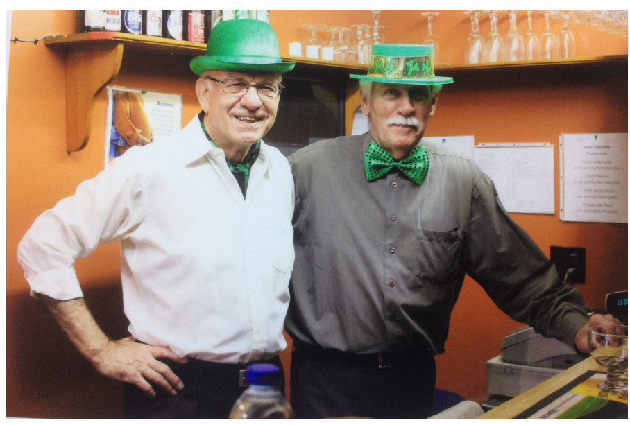
At your service.